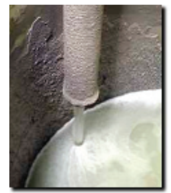
Clear, treated water arrives in the filtrate tank, where it is subsequently routed to a larger filtrate holding tank for reuse or to the sewer.

This type of design, in combination with lab and field experimentation to build an effective and efficient chemical regimen, keeps cycle times relatively brief. With 5 flood-and-brush coating machines running 2 shifts currently, the firm is now capable of processing 3 batches of wastewater daily, if necessary.